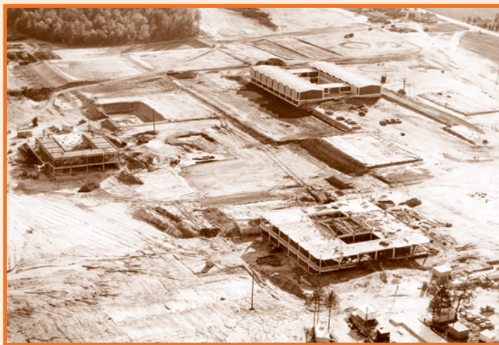
Methodist College campus under construction in the 1950s, laying a "Foundation for the Future."