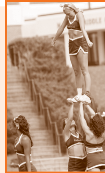
Left: Methodist College cheerleaders pump up the crowd during September's Family Weekend as the Monarchs faced N.C. Wesleyan

Monarch fans enjoyed food, fellowship, and music prior to kick-off. While coffee and donuts started football game day, the visit wouldn't have been complete without the tailgate picnic.