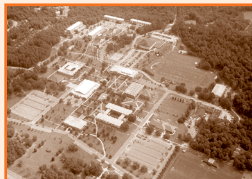
Methodist College campus today

Loyalty Day 2006 will be devoted to honoring the founders of Methodist College, who foresaw the need for larger numbers of strong, well-educated leaders in the future and made the contributions of time and resources necessary to provide for their education. Today, the need for access to the excellent, values-driven liberal arts education that Methodist College