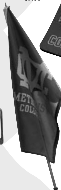
F. Weather- proof MC flag, $24.95

Specify color choice and options when necessary. Prices valid through next issue. Allow four to six weeks for delivery. Sorry, no CODs.