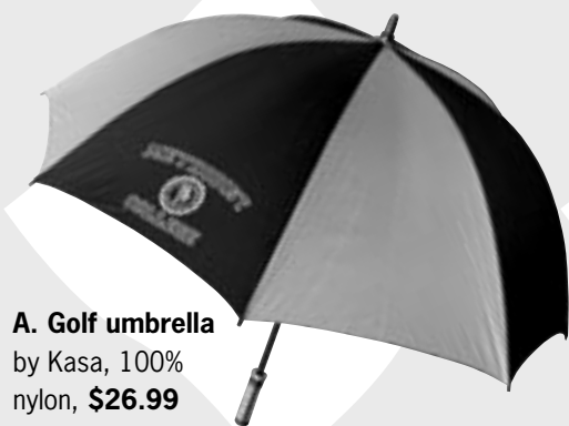
A. Golf umbrella by Kasa, 100% nylon, $26.99