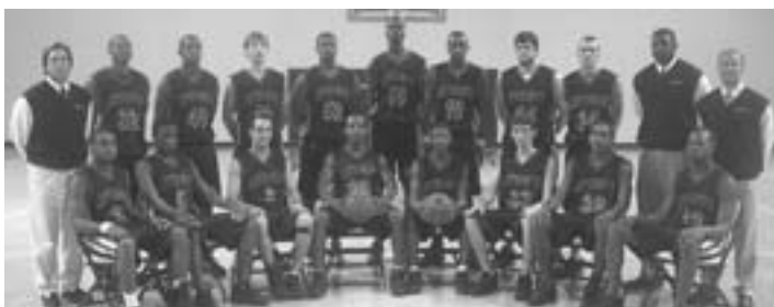
Men's Basketball (17-10) 2003 DIAC Co-Champions