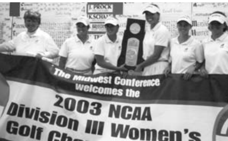
Women's Golf 2003 NCAA Division III Champions