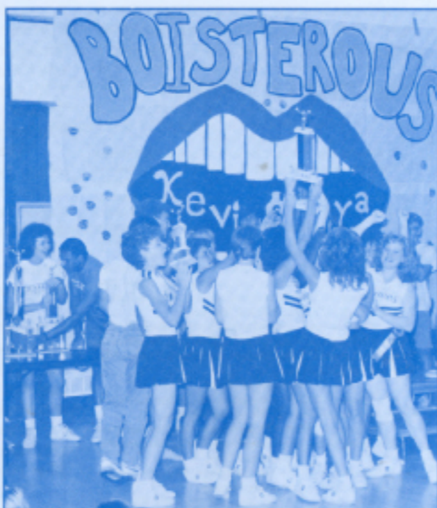
Carrington JHS takes trophy at East Coast Cheerleading Camp.