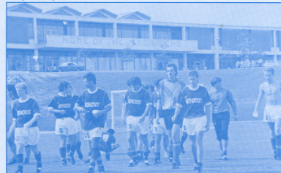
Members of the men's soccer team leave the field at the end of regulation against Pembroke September 3. Methodist won 1-0 in overtime.