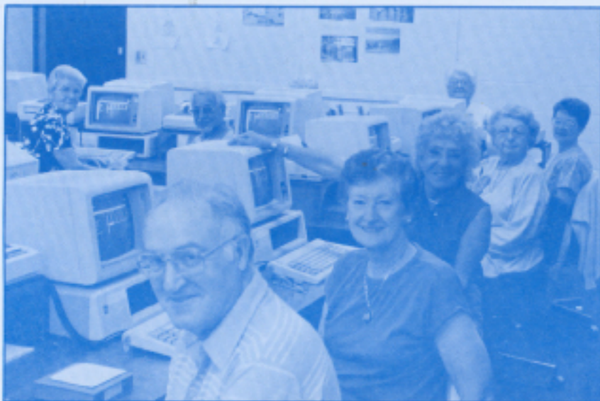
Elerhostelers master microcomputers.