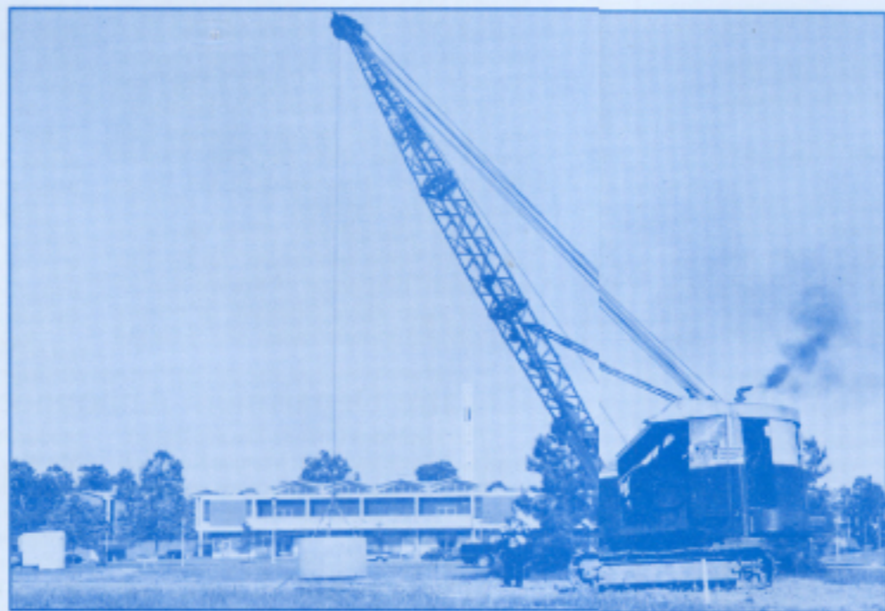
A crane with a concrete block compacts the soil at the site of the new Physical Activities Center.