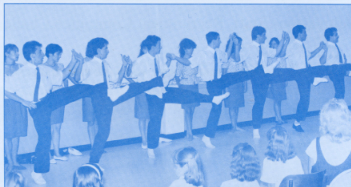
A dance troupe from Marseilles, France performs during a luncheon August 9.