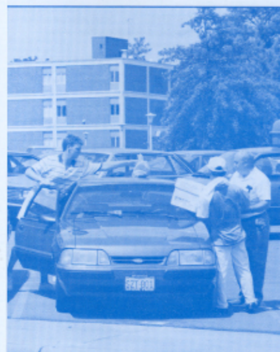
A new student gets a hand as he moves into Sanford Hall.