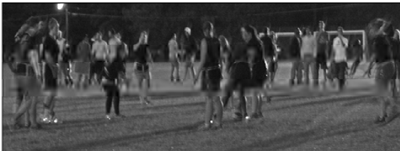
Teams match up and get ready to start to the game.