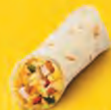
Chicken Breakfast Burrito