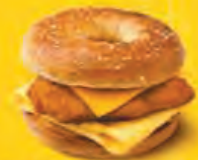
Chicken, Egg & Cheese On Sunflower Multigrain Bagel