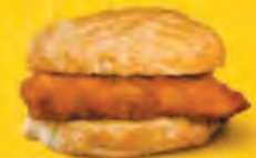
Chick-fil-A Chicken Biscuit

Served 6:00 to 10:30 AM 4611 Ramsey Street • (910) 488-1907