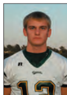
Junior QB No. 12