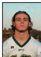
Sophomore WR No. 18