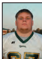
Junior C No. 67