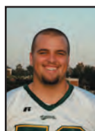
Junior RG No. 76