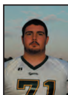
Junior LT No. 71