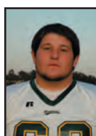
Junior LG No. 63