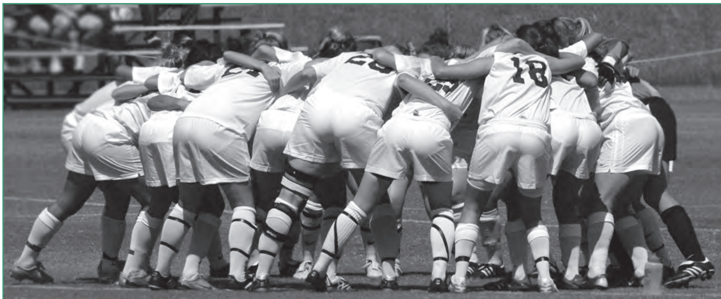
The 2007 soccer team gets the right attitude for the game.

The Monarchs were ranked at no. 8 in the region this past week. The team opens up at home against Birmingham Southern of Birmingham Ala. on Sept. 13 at 2 p.m.