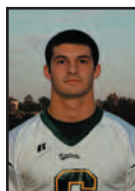
Junior WR No. 6