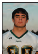
Senior TE No. 88