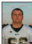
Sophomore RT No. 66