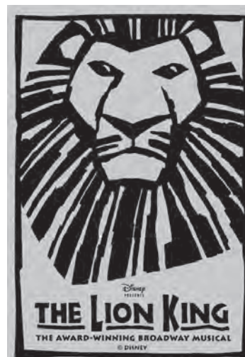
Program cover of the event.

The costumes and the set design were great, but the portrayal of the characters was the