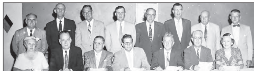
The first members of the Board of Trustees.