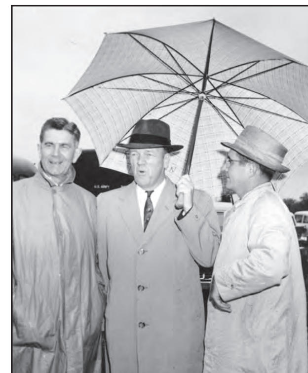
The three presidents of Methodist College.