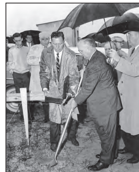
Groundbreaking of the college.