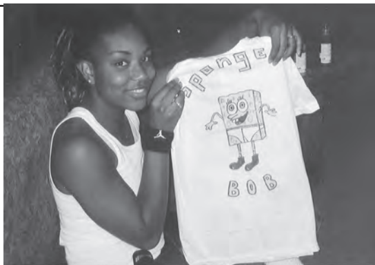
Sponge Bob Square Pants in his undies!