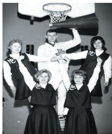
Students of the past pose in front of a basketball hoop.