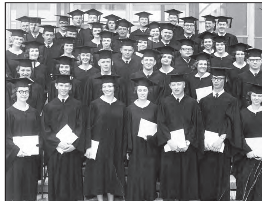
The first graduating class, the class of 1964.