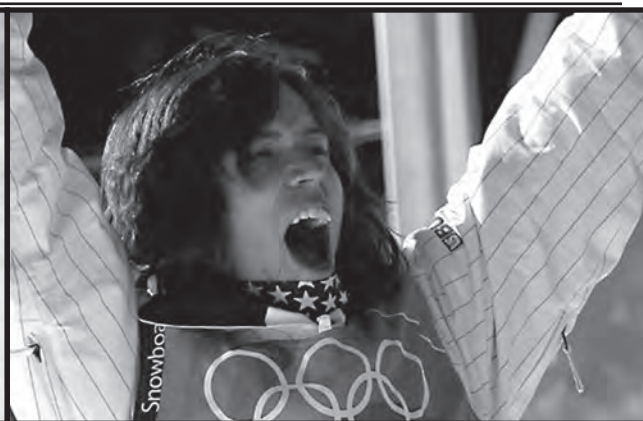
American Shaun White earned a gold medal for Men's Halfpipe Snowboarding.