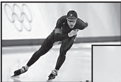
Left: American Chad Hedrick skates to gold.