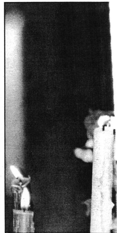
Lighting of the candles at the Alpha

members. All education men- strongly encouraged to participa- organization. SCEC membership opportunities for leadership devel- career advice, and peer support. M participate in fund-raising activit cial Olympics, and educational con