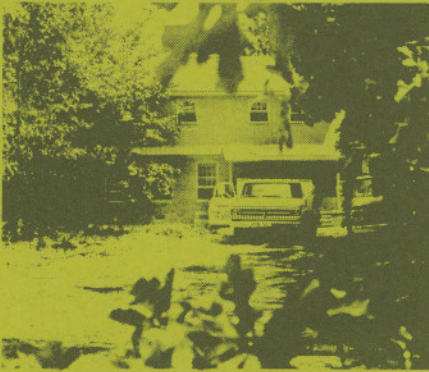
Construction on the new president's home continues on schedule.