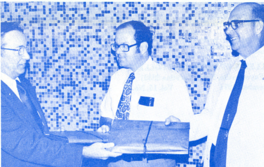
NEW METHODIST COLLEGE INSTRUCTORS WELCOMED