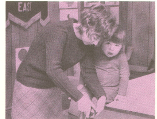
Group work may involve assisting a mentally handicapped child at a day care center.