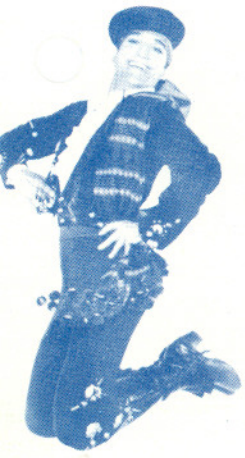
. . . and attending Concert - Lecture Series events such as the Jose Greco dance recital . . .