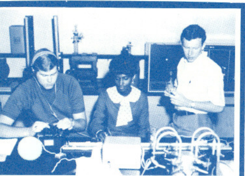
Spring semester found students pursuing studies such as a project in the physical chemistry lab . . .