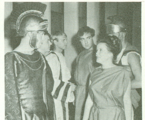
From the Drama