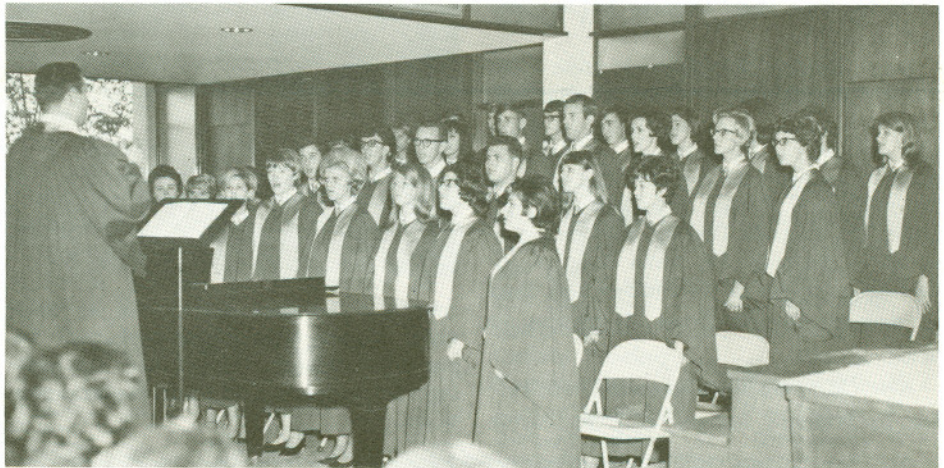
Methodist College Chorus Sings for Convocation

"3. That the state of North Carolina institute a scholarship program, providing a scholarship payment of at least $200 for every student attending a private college in North Carolina. This would relieve the state of the higher costs required of it when the student attends a state institution, because the state must now put out about $400 for every college student in a public college."