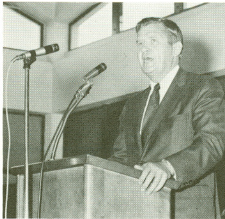
The Hon. Terry Sanford

Mr. Sanford was elected first chairman of the Methodist College board of trustees on July 3, 1956, prior to the chartering of the college on November 1, 1956.