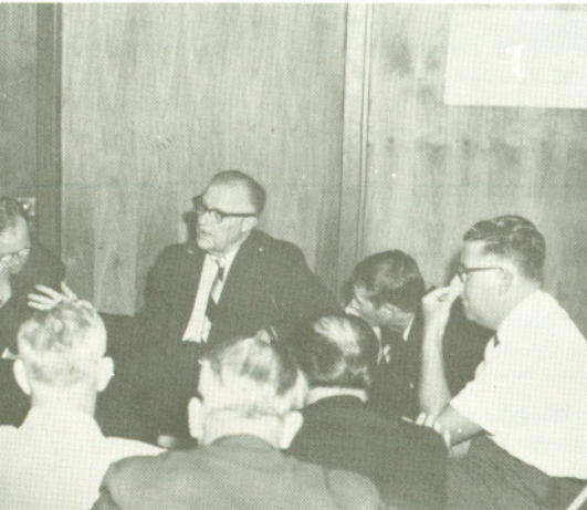
"Pastors' Conference On Evangelism"