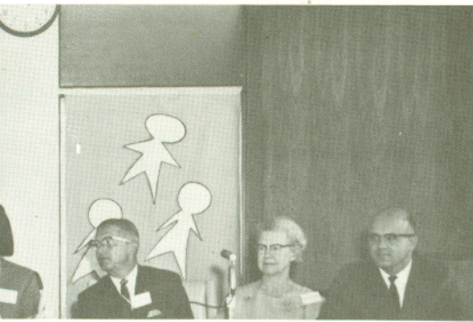
Service "School of Christian Mission"

The concluding program will be an Oratorio by the Methodist College Chorus, Fayetteville Symphony Orchestra and guest soloists. This program will be presented on May 14.