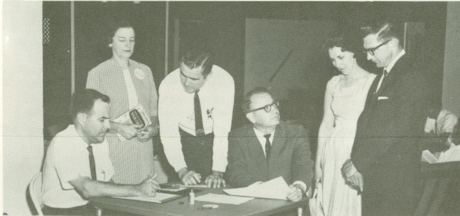
During Conference On "The Minister And His Wife"

tunity to provide facilities for these conferences and in so doing to say "thank you" for what the church has done and continues to do in helping to provide these campus facilities for the extension of Christian higher education.