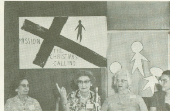
Panel During Woman's Society of Christian