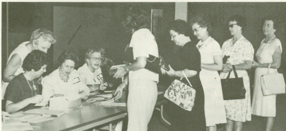
Registering For "Wesleyan Service Guild Weekend"