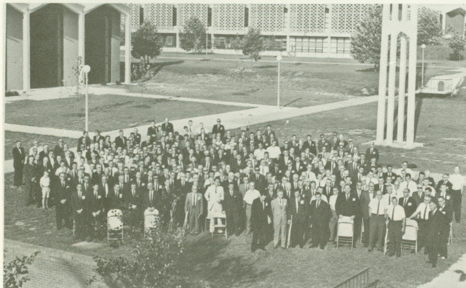
Early Morning During "Laymen's Retreat"