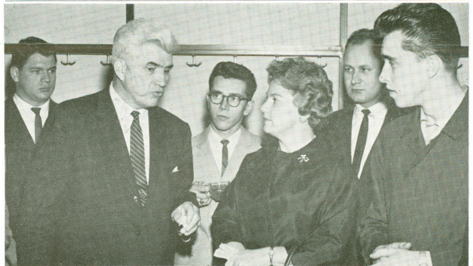
Dr. J. B. RHINE, second from left, noted parapsychologist from Duke University becomes involved in a serious discussion following his lecture before an audience of over 300 people in the college Union on April 17. His appearance was the last event in the public lecture series for the academic year 1961-62. He spoke on the subject "Parapsychology and Man's Search For Understanding." He emphasized the importance of understanding man as a spiritual being in a material world.

in which considerable interest has been shown by present and prospective students.